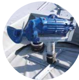
Mixer on mixerbase.